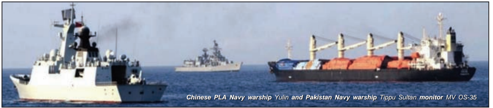
Chinese PLA Navy warship Yulin and Pakistan Navy warship Tippu Sultan monitor MV OS-35

and having contacted with the ship's crew, rescue operation started early Sunday morning.